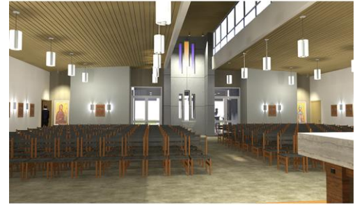
Archbishop High School – St. Thomas Chapel; Everett, WA

St. Mary's Parish; Anacortes, WA Addition to Existing Church 2003