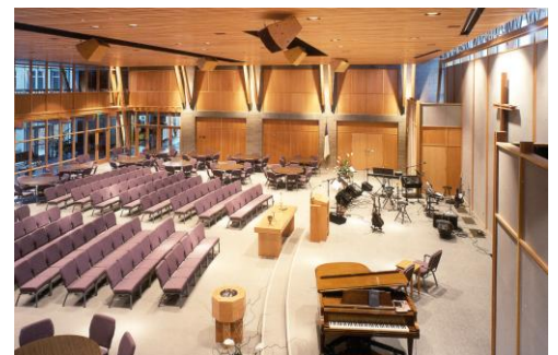
First Presbyterian Church; Wenatchee, WA