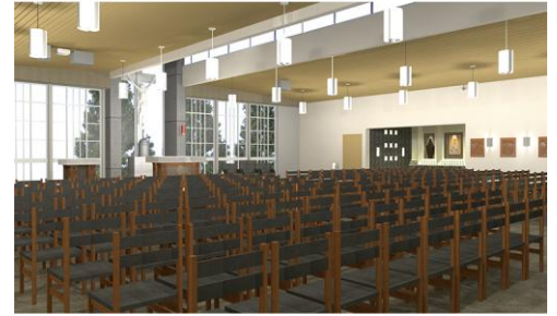
Archbishop High School – St. Thomas Chapel; Everett, WA